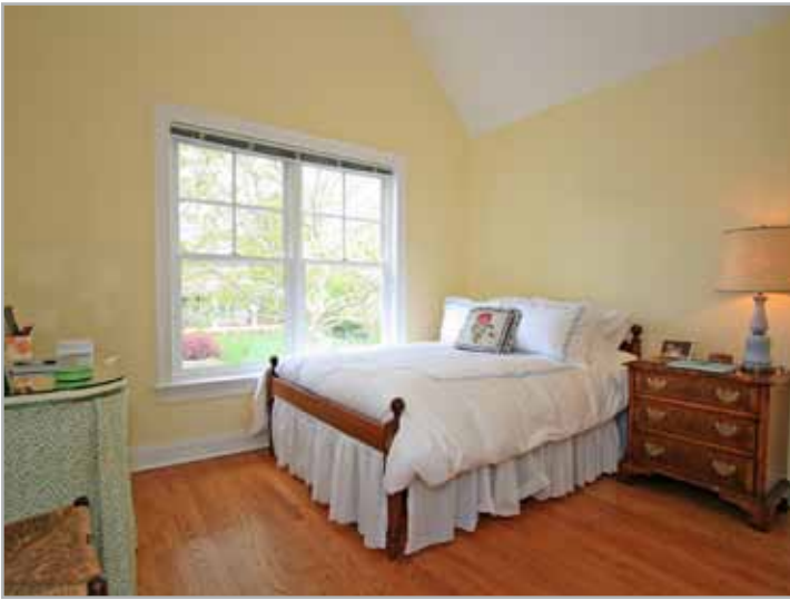
Bedrooms feature wood floors, sunny windows with great views, spacious closets and soaring ceilings.