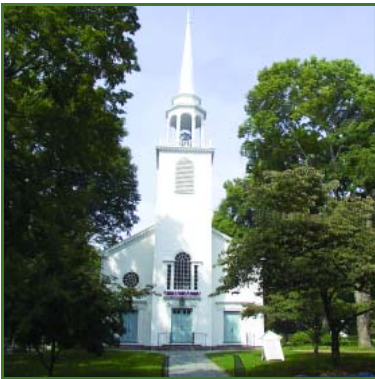
Greenfield Hill Congregational Church

Fairfield Historical Society Museum, 636 Old Post Road, offers a wide range of activities for youngsters and adults and has an extensive collection of area artifacts. The society has an ever-changing gallery with exhibits throughout the year including open houses following the town's Memorial Day Parade and the Christmas tree lighting on the Old Town Green.